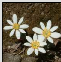
Bloodroot Sanguinaria canadensis

Join board member and wildflower enthusiast, Pat Sabold, for an easy to moderate walk in search of spring wildflowers. Wear comfortable shoes and bring water. Ages 8 and up. For more information, contact the park office at (717) 432-5011 or email psaboldFOPSP@aol.com .