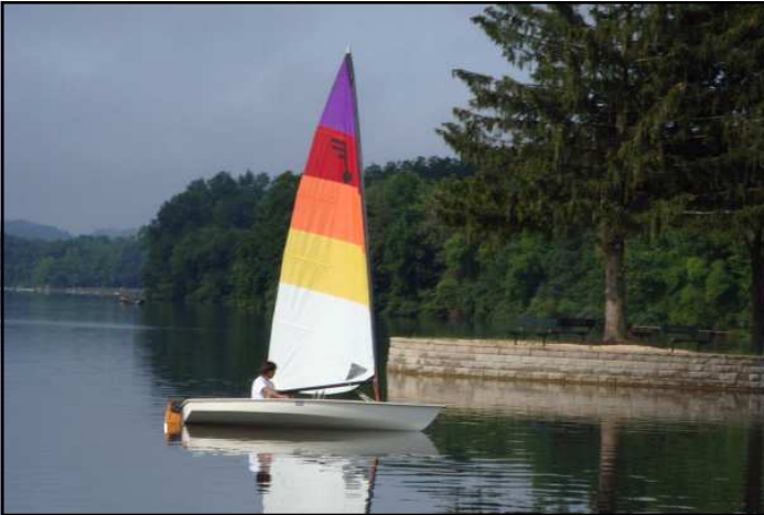
Sailboat on Pinchot Lake.

We often think of park activities requiring great physical exertion: ice boating, trail running, or warbler watching. For those of you tired of being cold, not interested in being rained upon, or just needing a break from all that, Gifford Pinchot State Park has the fair weather sport for you...sailboat watching! Yup, as long as you can see the boats, hear the cheering, or feel the warm sun and gentle breeze, this is the sport for you.