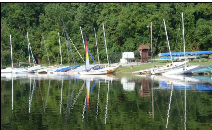
Sailboats moored at Boat Mooring #2.