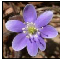
Round-lobed Hepatica Hepatica americana