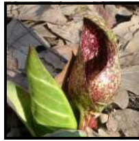
Skunk Cabbage Symplocarpus foetidus

Bloodroot ( Sanguinaria canadensis ): Large lobed leaves push out of the ground in a tight roll; unfurls to reveal a large pinwheel of slender satiny white petals around a yellow center.