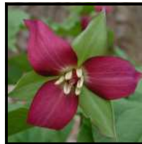
Trillium Trillium sp.

Rue Anemone ( Thalictrum thalictroides ): A whirl of dainty three-lobed leaves form a pedestal under small clusters of white or pinkish star-shaped flowers.