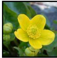
Marsh Marigold Caltha palustris