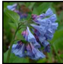
Virginia Bluebells Mertensia virginica