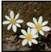
Bloodroot Sanguinaria canadensis