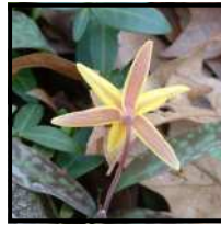
Trout Lily Erythronium americanum