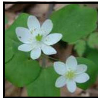
Rue Anemone Thalictrum thalictroides